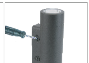
Select Warm White, Pure White, or Cool White (2700K, 3000K or 4000K)