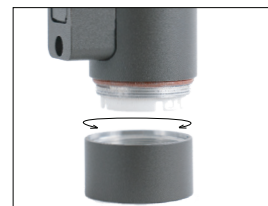
Continuously Adjustable Beam Angles Indexed at 35°, 45°, 55°