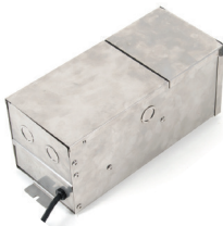
9600-TRN-SS 600W Max