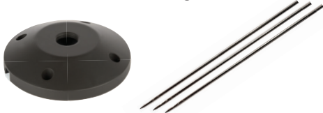
Surface Mount Flange/Stake

Includes three 7 inch threaded stainless steel stabilizing pins for ground mounting or surface mounts with four screws or over a junction box